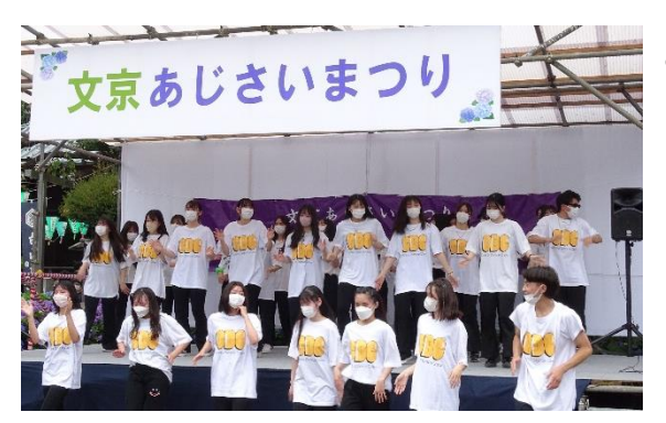
Dance Club Photos by the Photography Club

The students had to perform with masks on due to Covid-19, but they did their best and put on an excellent performance.